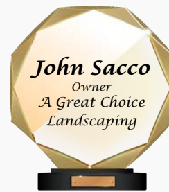
Solution of Hope Recipient